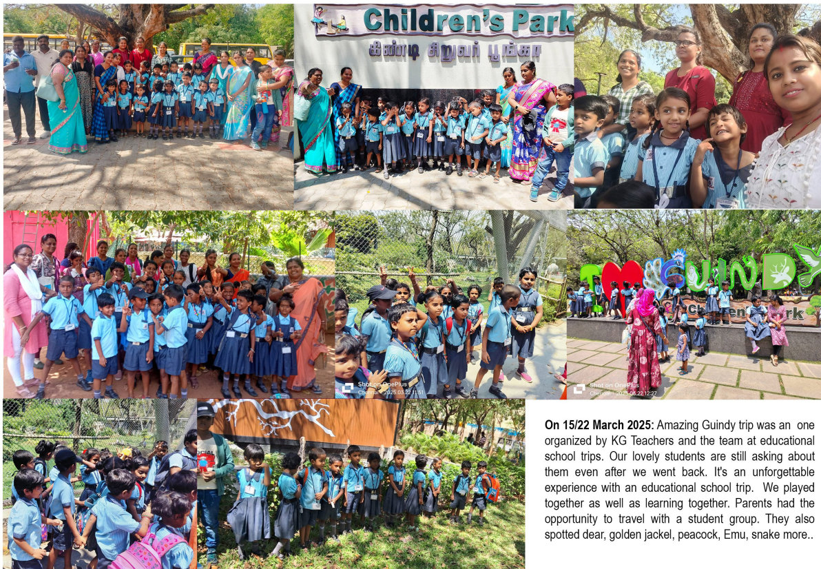
On 15/22 March 2025: Amazing Guindy trip was an one organized by KG Teachers and the team at educational school trips. Our lovely students are still asking about them even after we went back. It's an unforgettable experience with an educational school trip. We played together as well as learning together. Parents had the opportunity to travel with a student group. They also spotted deer, golden jackel, peacock, Emu, snake more..